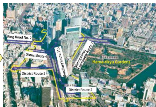
Shiodome area (project underway)