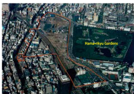
Shiodome area (before project)

Integrated development of the urban infrastructure is underway in the Shiodome district and the surrounding areas, centering around the former site of a Japan National Railways freight terminal, to advance mixed-use development with business, commercial, cultural, and residential facilities (project period: FY1994 through FY2015).