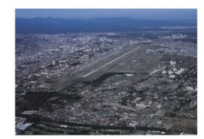
Yokota Air Base

In Tokyo, there are seven U.S. military installations (facilities and areas provided to the U.S. forces), including Yokota Air Base, where the headquarters of the U.S. Forces in Japan are located. Combined, they occupy approximately 1,600 hectares.