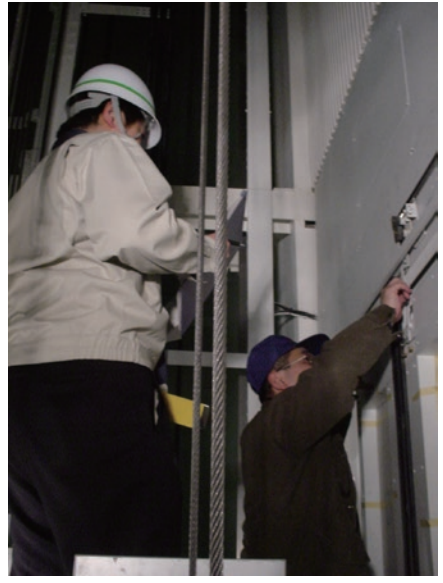
* Performed by Building Official or Designated Inspection Organization

Final inspection being carried out at a large building