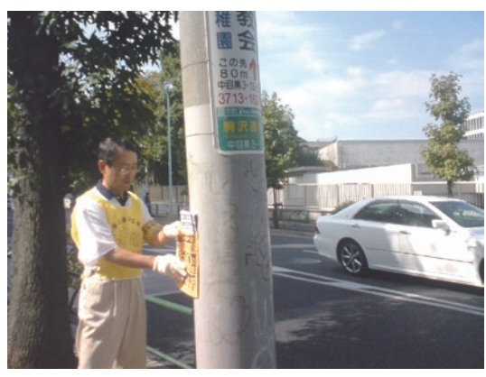
Campaign to remove illegal advertising

Since 2007, cooperative efforts to remove illegal signs along the course of the Tokyo Marathon before the holding of the marathon have also been conducted.