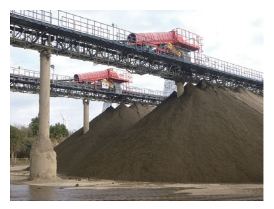
Soil refining plant