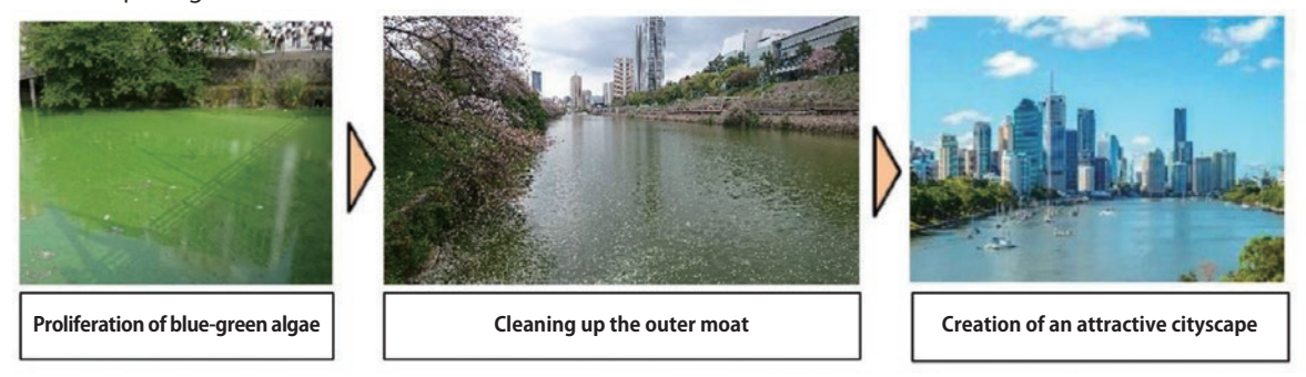
«Right image from Future Tokyo: Tokyo's Long-Term Strategy Version Up 2022 (February 2022)»

To achieve this, the TMG is working with relevant parties to study ways to secure the sources and amount of water necessary to be supplied to the moat, the construction of new waterways, and other matters. The TMG has publicized a basic plan, which includes an outline of routes to supply reclaimed water and water from the Arakawa River via the Tamagawa Josui and other waterways. In accordance with this plan, since fiscal 2022, the TMG has been implementing specific measures, such as creating preliminary designs for facilities needed to supply water to the moat, with the aim of completing construction in the mid-2030s.