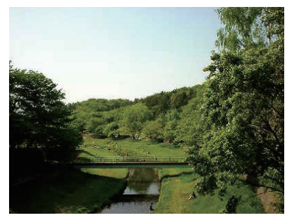
Central scenic belt of the Kokubunji cliff line (Chofu City)

For construction of large-scale buildings and other developments that require city planning decisions, a system for prior consultations at the planning stage of the project, before the start of actual application procedures, has been established to encourage plans that give due consideration to the landscape. These include high guality designs around the Imperial Palace and preservation of the scenic landscape of the Diet Building.