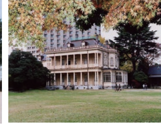
Historic landmarks especially important for the landscape Garden of the former residence of the lwasaki family (Taito-ku)

Also, among gardens and architectural structures with historical value, such as cultural properties, those which have an especially high impact on their surroundings in the creation of a good landscape are designated by the governor as "historic landmarks especially important for the landscape" (76 as of end-December 2022).