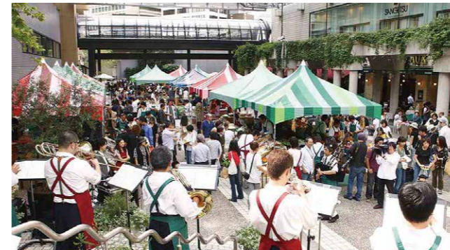
Events held in squares, atriums, and other spaces open to the public (left) Roppongi Hills (right) Futako Tamagawa Rise