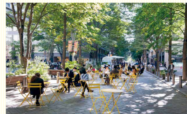
Use of road space on Marunouchi Naka-dori Street

centers for international economic activities. Through special provisions in these zones, efforts to create vitality are promoted, including the use of road space to hold various events.