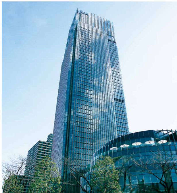
Tokyo Midtown Using the system of district planning to determine urban redevelopment promotion districts, a redevelopment project was implemented on the former site of the Defense Agency and the expansive Hinokicho Park that neighbors it. It opened in 2007 as a mixed-use facility that includes offices, residences, commercial facilities and cultural interaction facilities.