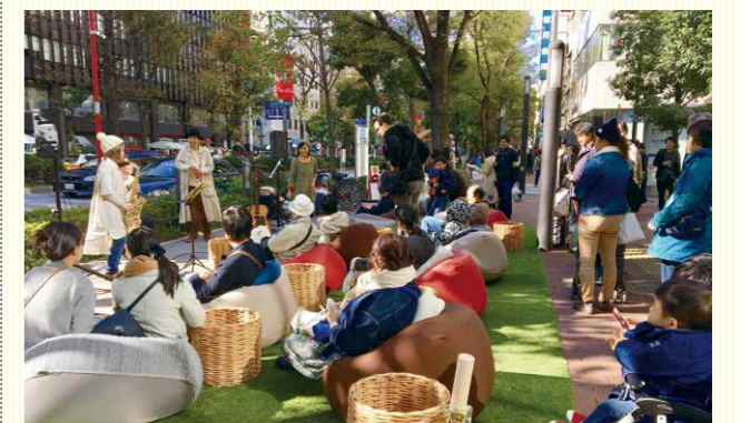
Social experiment on an open-air café and market at the street in front of the east exit of Ikebukuro Station.