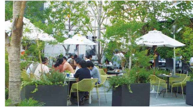
Open-air café using spaces open to the public (left) Nishiki-cho Trad Square Source: Yasuda Real Estate Co., Ltd. (right) Ochanomizu Sola City Source: Ochanomizu Sola City.

In the policy for use of various urban development systems, the use of land that a local municipality wishes to strengthen was expressed as "encouraged use of land" and developments were encouraged according to the district's features. Source: "Policy for Utilization of Various Urban Development Systems for New Urban Development" revised March 29, 2018. Bureau of Urban Development, Tokyo Metropolitan Government.