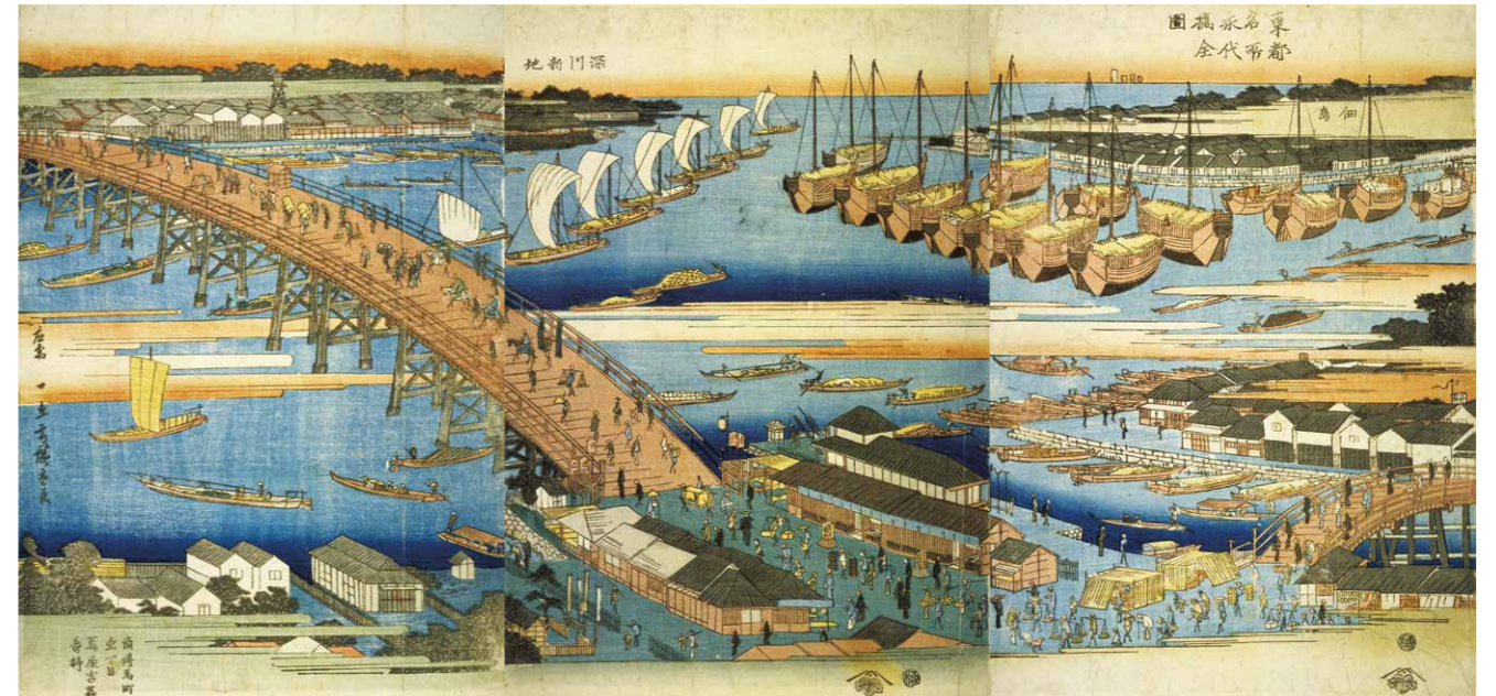
Hirokoji street and the river bank near Eitai Bridge Toto meisho Eitai-bashi zenzu (Famous Places of the Eastern Capital: Full View of Eitai Bridge) Eitaibashi Nishi-Hirokoji street at the foot of Eitai Bridge (bridge on the left) is bustling with people. Many warehouses line the banks of Horikawa canal, spanned by the Toyomi Bridge (bridge on the right).