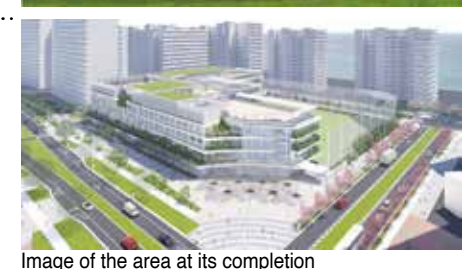
(simulated as of September2022)